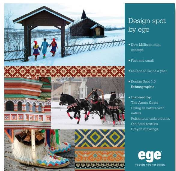
Design Spot by ege: A new collection currently under development by request of the innovation group.